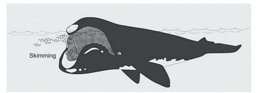
Figure 2 Skim feeding in right and bowhead whales. From Berta, A., and Sumich, J.L. (1999). "Marine Mammals: Evolutionary Biology," Academic Press, San Diego, CA.

Lunge feeding in rorquals is characterized by the intermittent engulfment and subsequent filtration of a large volume of preyladen water. This involves accelerating to high speed (2-5 m/s)and followed by deceleration as the water and prey enter the mouth (Fig. 3). To maximize engulfment volume, the lower jaw opens to almost 90° of the long body axis. This is possible because the jaw joints exhibit a complete loss of the typical mammalian synovial jaw joint and instead consist of a highly flexible connection between the base of the skull and lower mandibles. The expansion of the mouth during each lunge greatly increases drag, causing the deceleration. Therefore, the next lunge feeding event requires another acceleration to high speed. Both the high drag during engulfment and the repeated acceleration suggest that that lunge filter feeding is energetically costly (Croll et al., 2001; Goldbogen et al., 2006; Goldbogen et al., 2007). Despite the high energetic cost, the tremendous engulfment capacity allows for high prey intake and thus overall high energetic efficiency when feeding on high-density prey patches (Goldbogen et al., 2011).